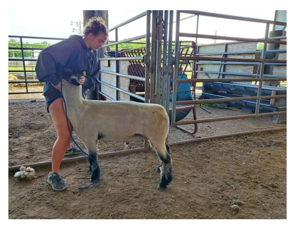
Some of our students have a previous show experience. Other do not.