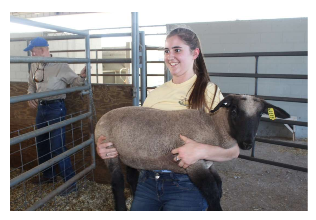
The lambs are a big hit in classes.