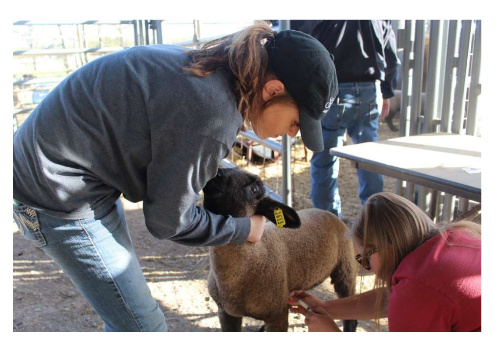
Hands on learning is important to our program.