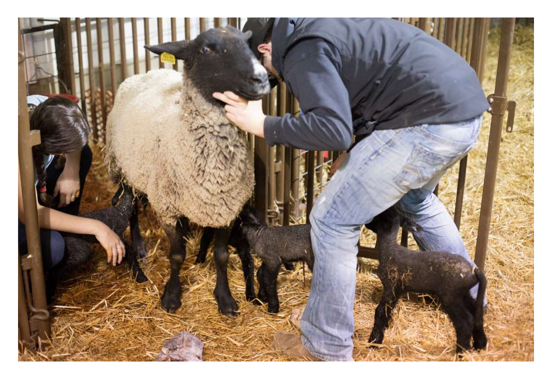
The lamb watch students spend nights and weekends lambing out ewes and caring for baby lambs.