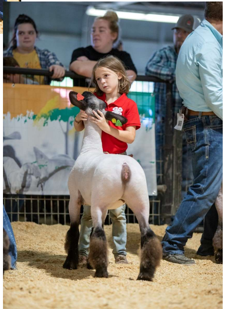
Hannah Montana is also a Snoopy out of a Maye ewe.