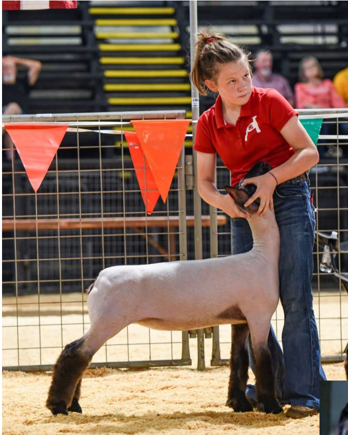
Raya was a fun one to show in 2021. She won her class several times. She was a Snoopy (Prince Louis son) out of a Road Trip ewe from the University